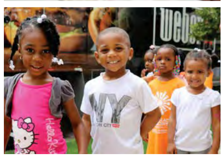
Weber Grills held a summer block party for our children and youth.