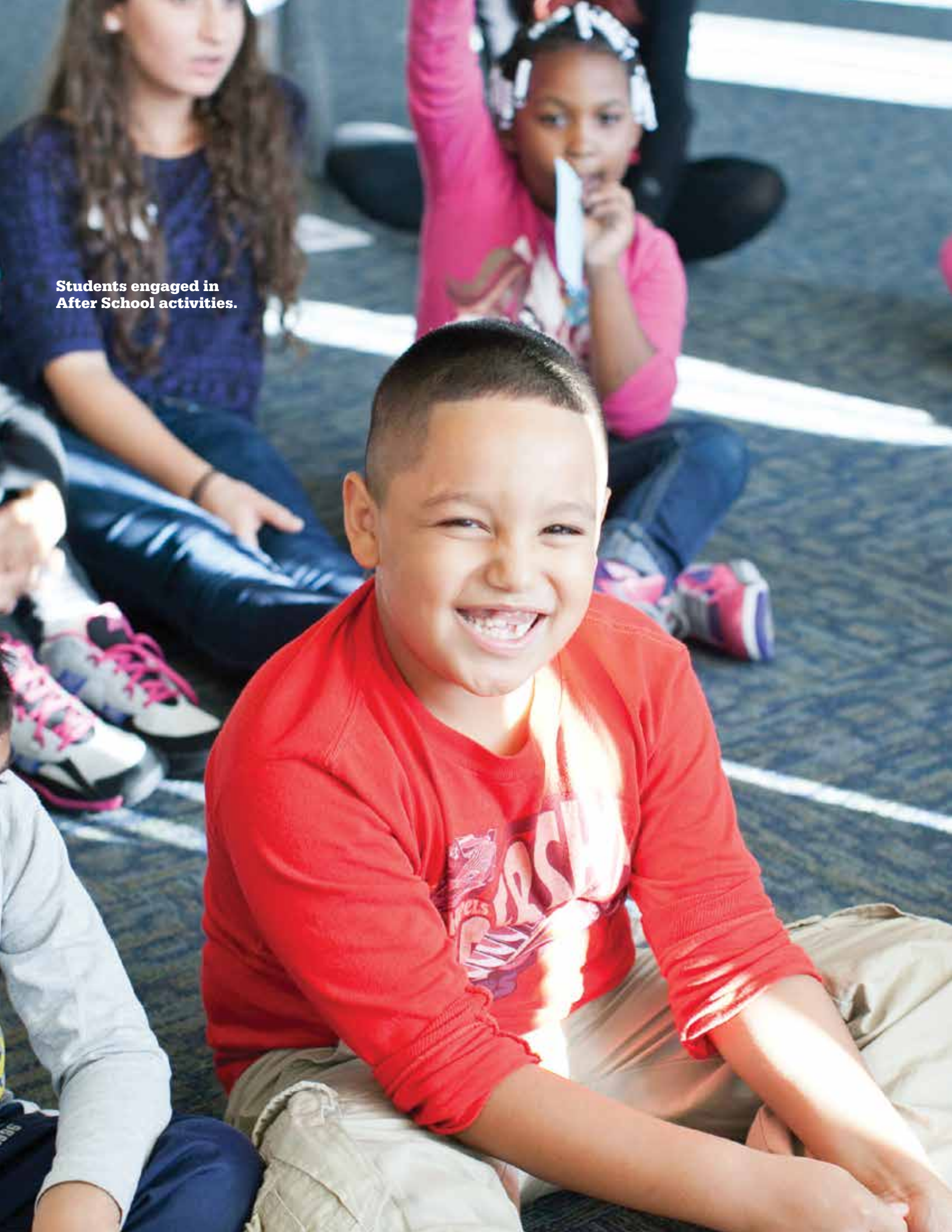
Students engaged in After School activities.