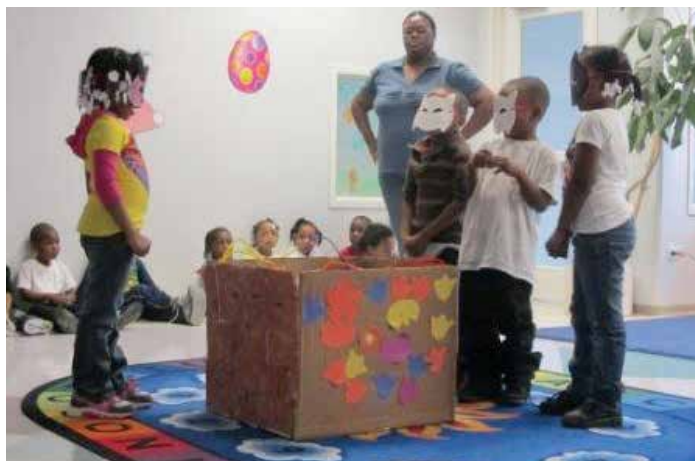
Children in the Early Childhood Development Program perform a skit during Week of the Young Child celebrations