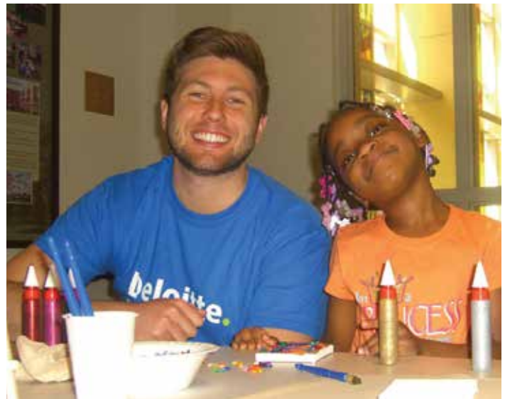
A volunteer from Deloitte & Touche enjoys a moment with a young girl during a service project.